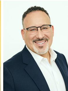
★Dr. Miguel Cardona★ Education